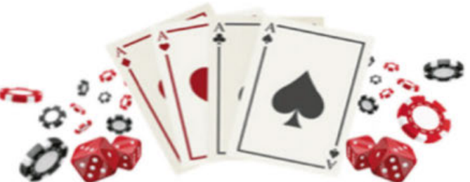
HIT THE JACKPOT OF FUN AND FUNDRAISING AT ST. JULIANA'S ANNUAL GALA!

PLACE YOUR BETS, ROLL THE DICE, AND SAVE THE DATE FOR: