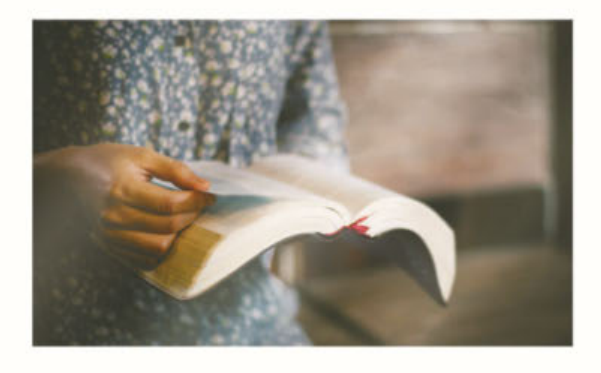
Excerpts from the Lectionary for Mass ©2001, 1998, 1970 CCD. The English translation of Psalm Responses from Lectionary for Mass © 1969, 1981, 1997, International Commission on English in the Liturgy Corporation. All rights reserved.

Is 60:1-6/Ps 72:1-2, 7-8, 10-11, 12-13 (see 11)/Eph 3:2-3a, 5-6/Mt 2:1-12